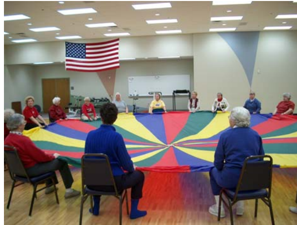
Body Recall Exercise Class