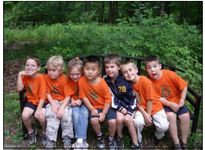
Preschool Nature Walk at Oak Openings