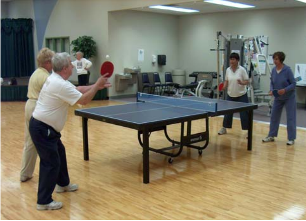
Table Tennis during Open Gym