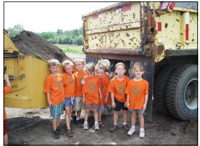
Field Trip to Sylvania Compost Site