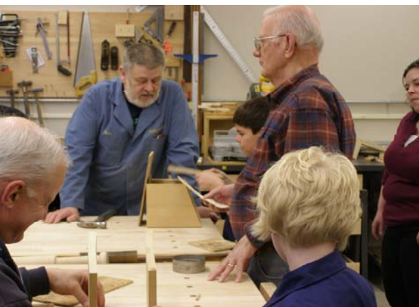
Woodshop Volunteers teaching Boy Scouts to build birdhouses